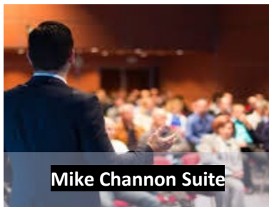
Mike Channon Suite

*3 themes participants can attend any one session