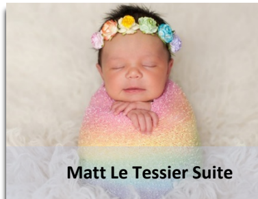
Matt Le Tessier Suite