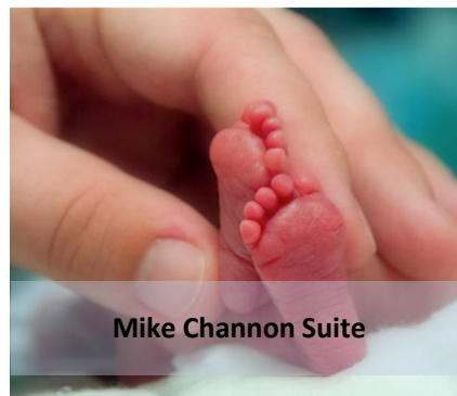
Mike Channon Suite