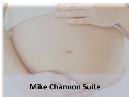
Mike Channon Suite