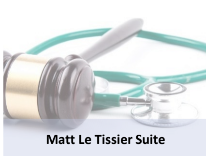
Matt Le Tissier Suite

*3 themes participants can attend any one workshop