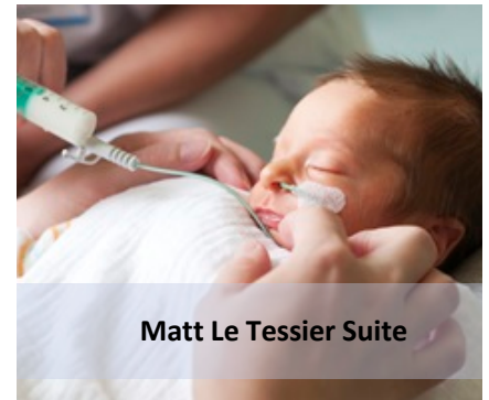
Matt Le Tessier Suite